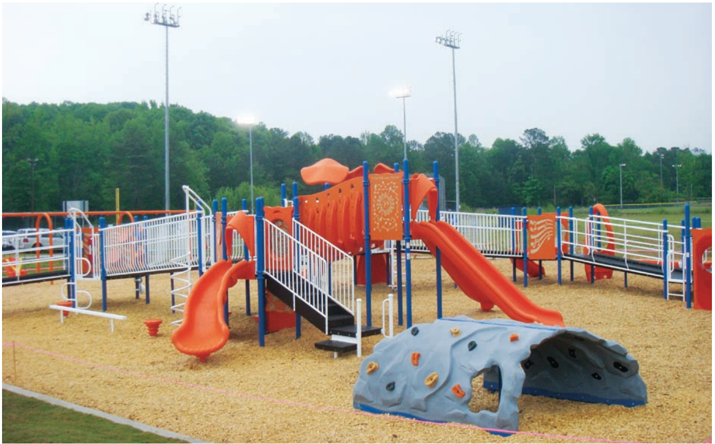
A major goal of the foundation is to support construction of at least one playground a year, frequently in partnership with a city or county government. Pictured here is the playground in Acworth.

12 metro counties. Resurgens Orthopaedics also has three specialty centers — the Spine Center, the Hand Center and the Joint Replacement Center — comprised of multidisciplinary teams of board-certified nonsurgical and surgical physicians, physician assistants, nurses and therapists.